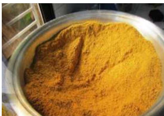
Photo 1. Parkia biglobosa pulp meal.